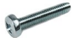
countersunk screw DIN 7985