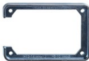
installation frame for door thickness >6 - 19,5 mm