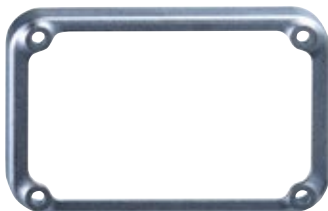
installation frame for door thickness 0,5 - 6 mm